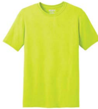
GILDAN Performance® T-Shirt 42000 | Adult Sizes: S-3XL