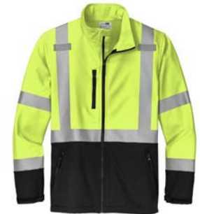
CORNERSTONE® ANSI 107 Class 3 Soft Shell Jacket CSJ503 | Adult Sizes: S-5XL