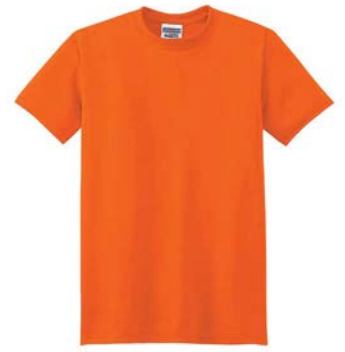
JERZEES® Dri-Power® 100% Polyester T-Shirt 21M | Adult Sizes: S-3XL