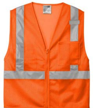
CORNERSTONE® ANSI 107 Class 2 Mesh Zippered Vest CSV102 | Adult Sizes: S/M, L/XL, 2XL/3XL, 4XL/5XL