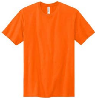
VOLUNTEER KNITWEAR™ All-American Tee VL100 | Adult Sizes: S-4XL