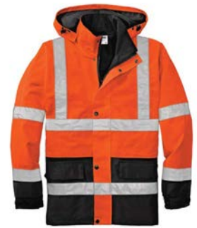
CORNERSTONE® ANSI 107 Class 3 Waterproof Parka CSJ24 | Adult Sizes: S-4XL