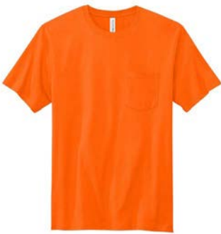
VOLUNTEER KNITWEAR™ All-American Pocket Tee VL100P | Adult Sizes: S-4XL