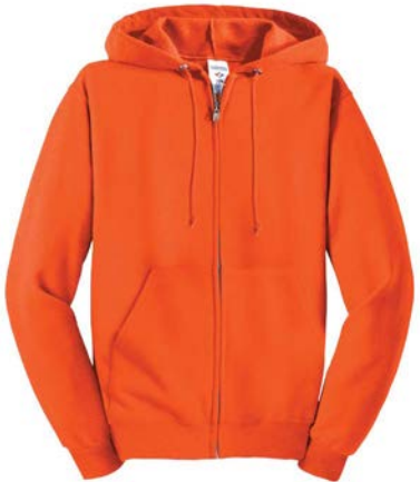
JERZEES® NuBlend® Full-Zip Hooded Sweatshirt 993M | Adult Sizes: S-3XL