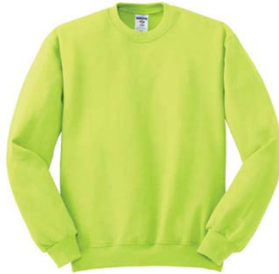
JERZEES® NuBlend® Crewneck Sweatshirt 562M | Adult Sizes: S-4XL