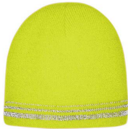
CORNERSTONE® Lined Enhanced Visibility with Reflective Stripes Beanie CS804