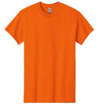
GILDAN® Heavy Cotton™ 100% Cotton T-Shirt 5000 | 5000B | Adult Sizes: S-3XL | Youth Sizes: XS-XL