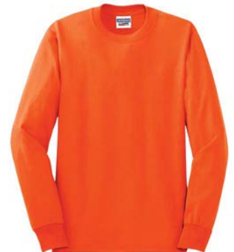
JERZEES® Dri-Power® 50/50 Cotton/ Poly Long Sleeve T-Shirt 29LS | Adult Sizes: S-3XL