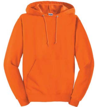
JERZEES® NuBlend® Pullover Hooded Sweatshirt 996M | Adult Sizes: S-4XL