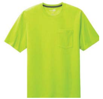
CORNERSTONE® Workwear Pocket Tee CS430 | Adult Sizes: S-4XL