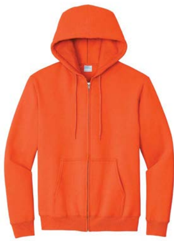
PORT & COMPANY® Essential Fleece Full-Zip Hooded Sweatshirts PC90ZH | PC90ZHT | Adult Sizes: S-4XL Tall Sizes: LT-4XLT