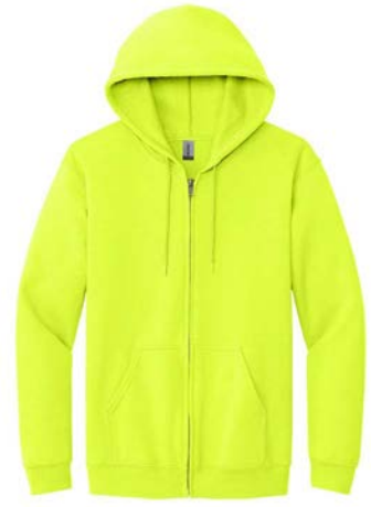
GILDAN® Heavy Blend™ Full-Zip Hooded Sweatshirt 18600 | Adult Sizes: S-5XL