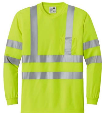
CORNERSTONE® ANSI 107 Class 3 Long Sleeve Snag-Resistant Reflective T-Shirt CS409 | Adult Sizes: XS-4XL