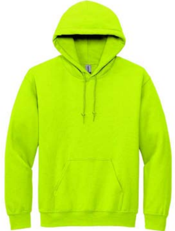
GILDAN® DryBlend® Pullover Hooded Sweatshirt 12500 | Adult Sizes: S-3XL