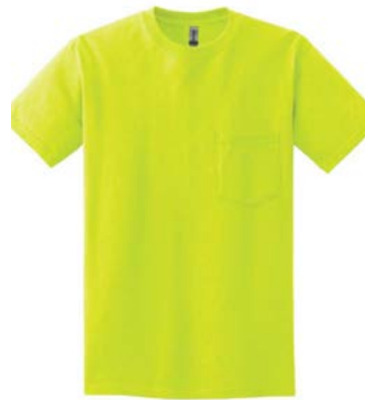
GILDAN® Ultra Cotton® 100% US Cotton T-Shirt with Pocket 2300 | Adult Sizes: S-5XL