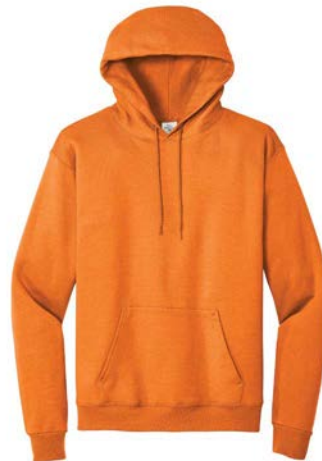
HANES® EcoSmart® Pullover Hooded Sweatshirt P170 | Adult Sizes: S-5XL