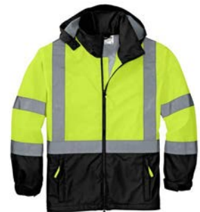
CORNERSTONE® ANSI 107 Class 3 Safety Windbreaker CSJ25 | Adult Sizes: S-4XL