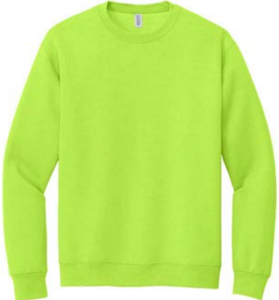
JERZEES® Super Sweats® NuBlend® Crewneck Sweatshirt 4662M | Adult Sizes: S-3XL