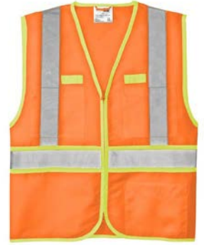
CORNERSTONE® ANSI 107 Class 2 Dual-Color Safety Vest CSV407 | Adult Sizes: S-4XL