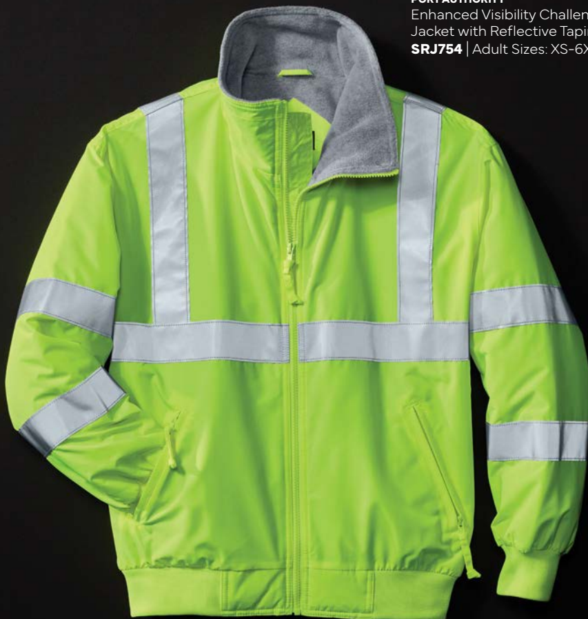
PORT AUTHORITY® Enhanced Visibility Challenger™ Jacket with Reflective Taping SRJ754 | Adult Sizes: XS-6XL