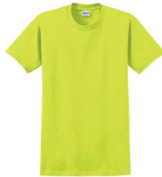
GILDAN® Ultra Cotton® 100% US Cotton T-Shirts 2000 | 2000T | 2000B | Adult Sizes: S-5XL | Tall Sizes: LT-3XLT | Youth Sizes: XS-XL