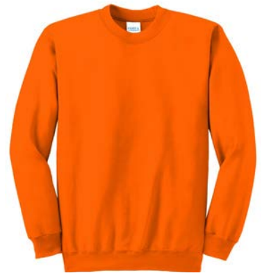
PORT & COMPANY® Essential Fleece Crewneck Sweatshirts PC90 | PC90T | Adult Sizes: S-4XL Tall Sizes: LT-4XLT