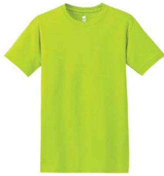
HANES® Essential-T 100% Cotton T-Shirt 5280 | Adult Sizes: S-3XL