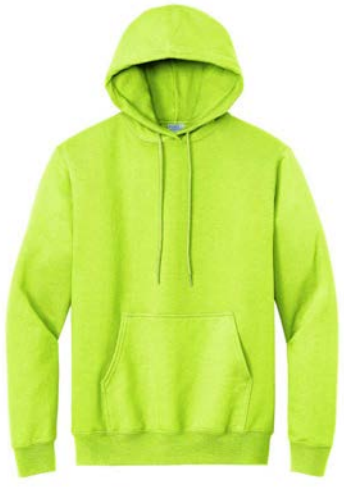
PORT & COMPANY® Essential Fleece Pullover Hooded Sweatshirts PC90H | PC90HT | Adult Sizes: S-4XL Tall Sizes: LT-4XLT