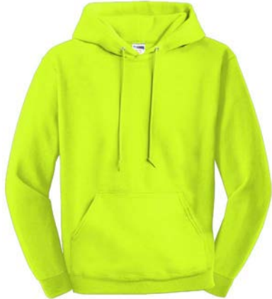
JERZEES® Super Sweats® NuBlend® Pullover Hooded Sweatshirt 4997M | Adult Sizes: S-3XL