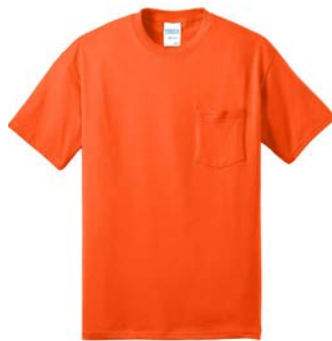
PORT & COMPANY® Core Blend Pocket Tees PC55P | PC55PT Adult Sizes: S-6XL | Tall Sizes LT-4XLT