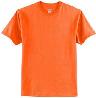
HANES® Authentic 100% Cotton T-Shirt 5250 | Adult Sizes: S-5XL