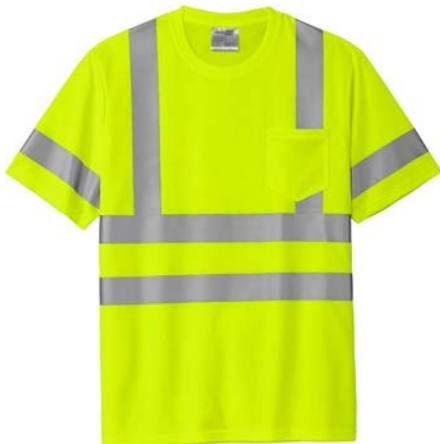
CORNERSTONE® ANSI 107 Class 3 Mesh Tee CS202 | Adult Sizes: M-5XL