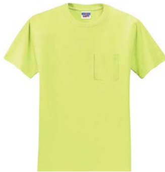
JERZEES® Dri-Power® 50/50 Cotton/ Poly T-Shirts 29M | 29B | Adult Sizes: S-5XL | Youth Sizes: XS-XL