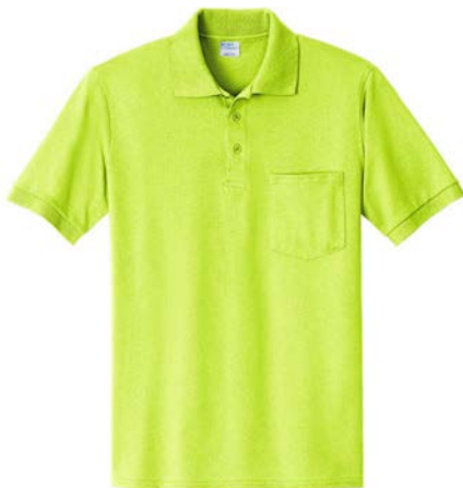
PORT & COMPANY® Core Blend Jersey Knit Pocket Polo KP55P | Adult Sizes: S-6XL