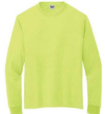
JERZEES® Dri-Power® 100% Polyester Long Sleeve T-Shirt 21LS | Adult Sizes: S-3XL