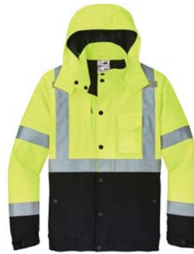
CORNERSTONE® ANSI 107 Class 3 Waterproof Insulated Ripstop Bomber Jacket CSJ501 | Adult Sizes: S-5XL