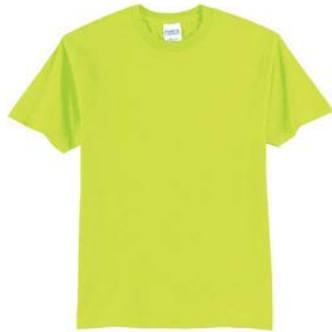
PORT & COMPANY® Core Blend Tee PC55 | PC55T | PC55Y | Adult Sizes: S-6XL | Tall Sizes: LT-4XLT | Youth Sizes: XS-XL