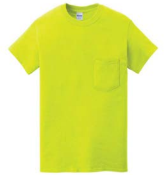
GILDAN® Heavy Cotton™ 100% Cotton Pocket T-Shirt 5300 | Adult Sizes: S-3XL