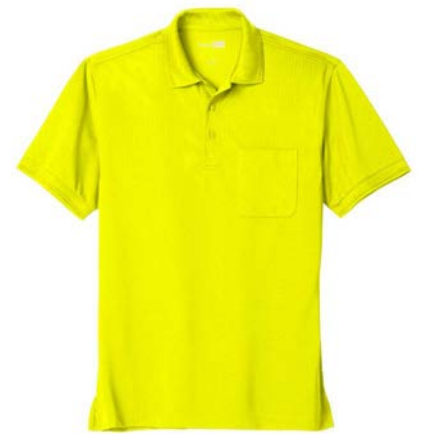
CORNERSTONE® Industrial Snag-Proof Pique Pocket Polo CS4020P | Adult Sizes: XS-6XL